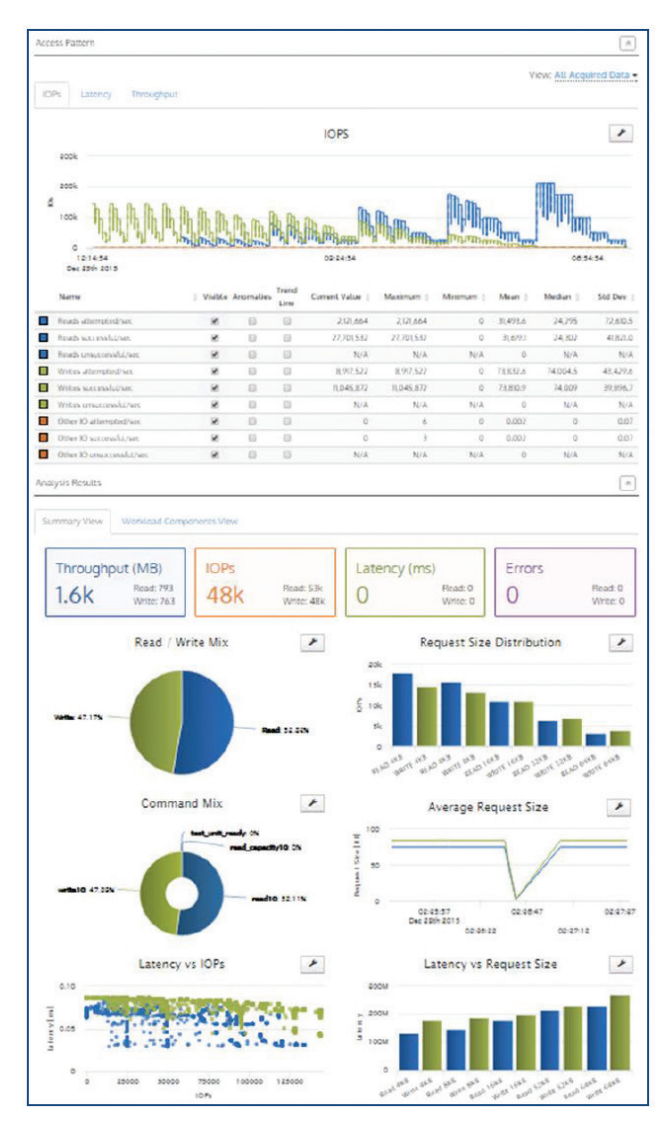
Figure 1: WorkloadWisdom Workload Analyzer module

The Latency vs. IOPS can establish the relationship between the two and by watching trends, you can often uncover problems. For instance, if in a workload the latency is going up at the point where IOPS are increasing, the system is overloaded.