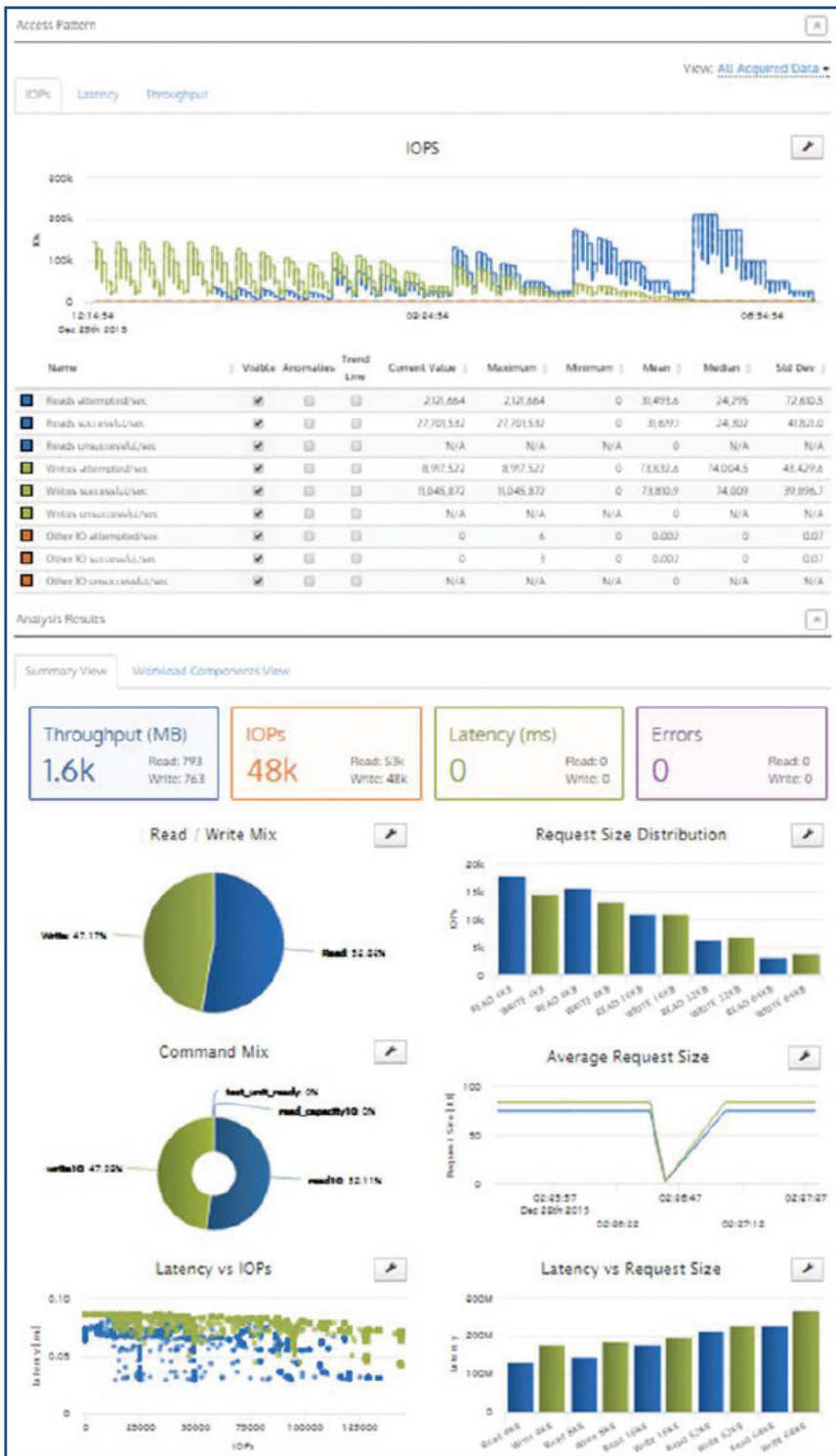
Figure 1: Load DynamiX Workload Analyzer module of Load DynamiX Enterprise

Justin Richardson STORAGE ENGINEER GO DADDY